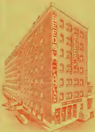
OFFICE AND MAIN PLANT 500 SO. FIRST ST., ST. LOUIS

Floor space 80,000 sq. feet Address all communications to St. Louis, Mo.